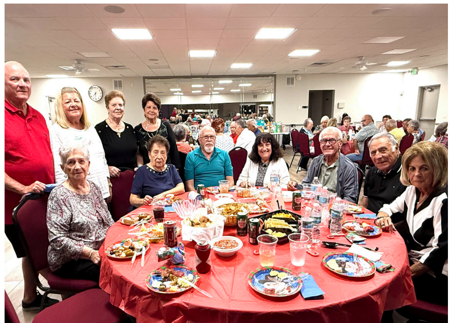
Residents enjoying the Italian American Club Holiday Party